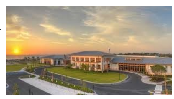
Jekyll Island Conference Cen-